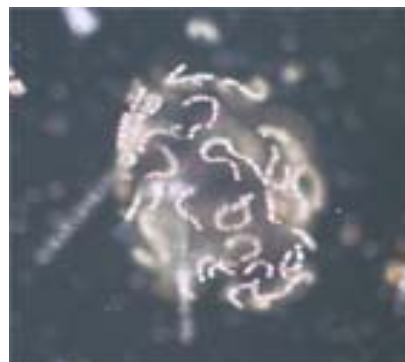
Chaetoceros socialis colonies