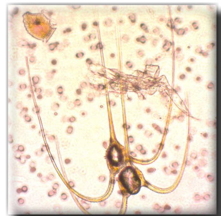
The dinoflagellate Ceratium macroceros was abundant at Fladen.

A chlorophyll fluorescence maximum at 17 meters depth revealed a diverse phytoplankton community dominated by diatoms of which Skeletonema marinoi was the most numerous species.